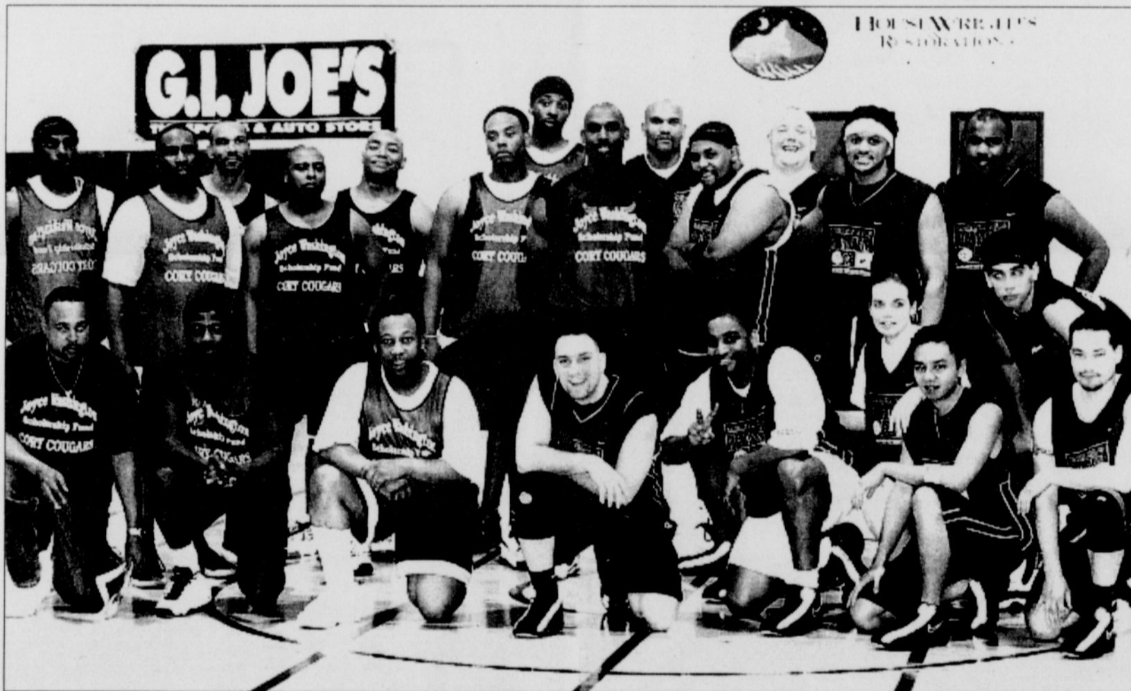
The Portland Observer Cory Cougars with Jammin' 95.5 Nike Big Ballers

The Joyce Washington Memorial Scholarship Fund is designed to assist minority high school students transitioning from high school to college with an interest in Business, English, Journalism or Athletics.