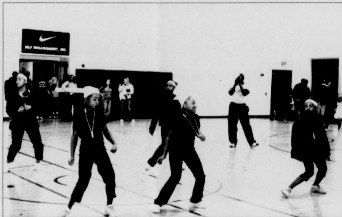
5's of Charm performing at half-time