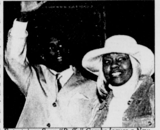
Entertainer Sean "Puffy" Combs leaves a New York courthouse with his mother after being acquitted on weapons charges.