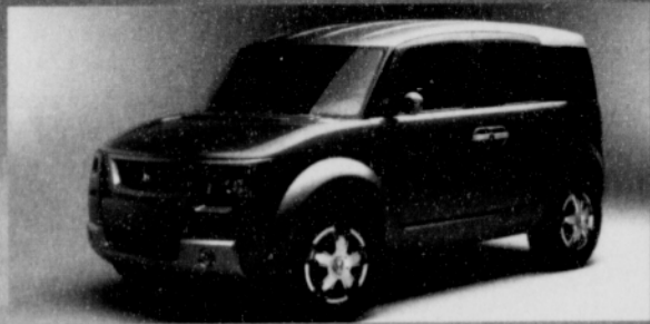
Honda Model X