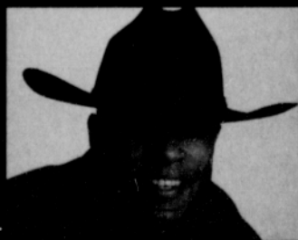
Ribbs Rolls NASCAR - page 42