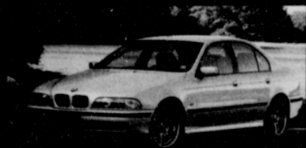
Bodacious Bimmer - page 18