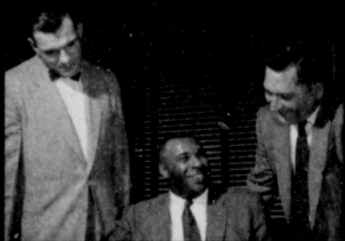
The Legacy Lives - page 25