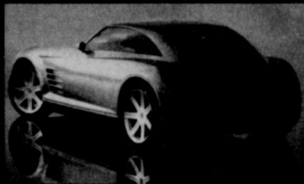
The Future Is Now - page 36