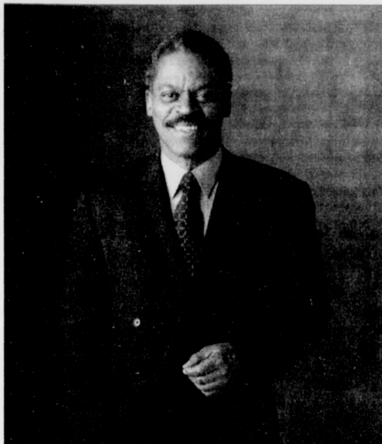
Washington State will present Bernard Shaw with the university's annual Edward R. Murrow Award.

His regular broadcast assignments include coanchoring "Inside Politics" and "CNN Worldview," a half-hour interna-