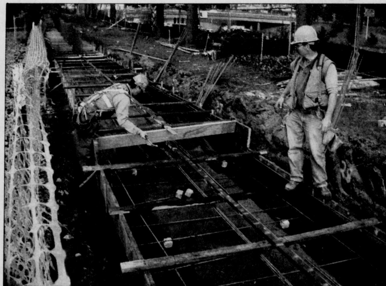
Crews prepare the footings for soundwalls just north of Skidmore as part of the Oregon Department of Transportation's I-5 Preservation Project. Crews are also relocating utility lines, forcing some closures in the streets adjacent to the freeway. Restricted traffic is also in effect on the Lombard and Portland Boulevard overpasses as crews work to raise the structures to allow better clearance for freeway truck traffic.