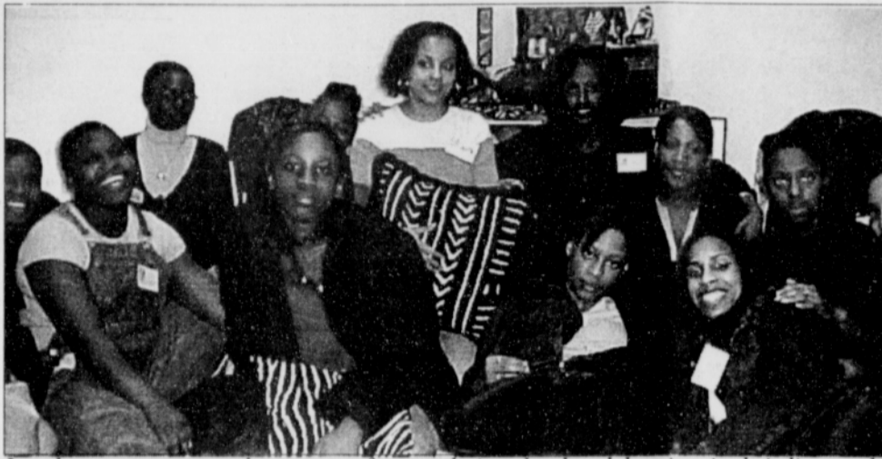
Local young women gather at a conference designed to break barriers in their lives and bring peace to themselves and others.

Portland Parks and Recreation's Outdoor Recreation Program, in collaboration with The Audobon Society of Portland and Tualatin Riverkeepers, will host a leisurely kayak or canoe paddle along the Tualatin River. This is a great trip for the novice paddler to explore the riparian forests along the river, as the water is calm and the distances are short. Participants provide their own boats. Call 503/823-5132 for more information and to register.