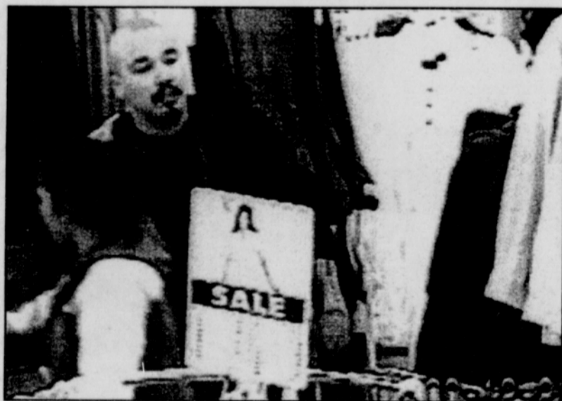
Surveillance video captures two suspects accused of using a woman's stolen credit card in a Milwaukee store after robbing the woman at gunpoint.