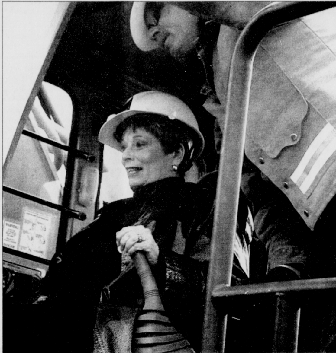
Mayor Vera Katz takes the controls of a backhoe to mark the groundbreaking of an expanded Oregon Convention Center.

The landmark coliseum needs expensive repairs and renovation. And it is in the middle of a four city-block area that planners think could be used to create a more vibrant urban neighborhood. At the request of Portland Mayor Vera Katz, planning consultants began a review of the Rose Quarter last fall. They are to submit their recommendations later this month. Their options will include possible developments with, and without, the Coliseum. The biggest problem with the venue? The 12,000-seat arena is too small for major league sports but too big for many college and high school events.