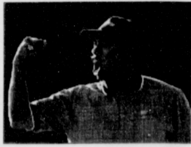
Tiger Woods will earn $56 million dollars this year alone.

(AP) - Fueled by Tiger Woods, endorsement spending for golf has reached $400 million worldwide, according to a survey by Golf World magazine.