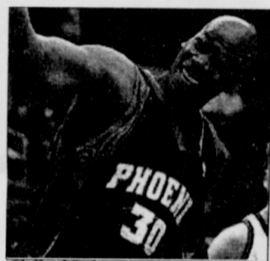
Clifford Robinson faces a day in court after a DUI arrest.

SCOTTSDALE, Ariz. (AP) - Clifford Robinson of the Phoenix Suns was arrested Monday on charges of driving under the influence and marijuana possession.