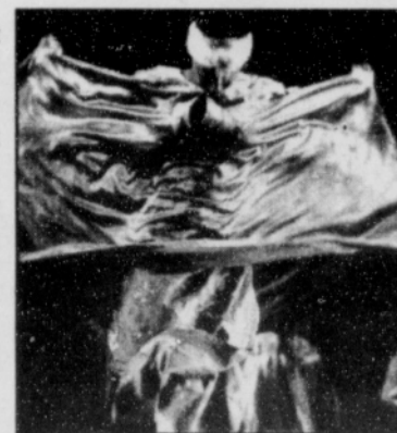
The Northwest Afrikan American Ballet.

dation will do a slide presentation about "Historic Buildings of the African-American Communities." Her presentation will include information about private residences, churches, social halls and commercial buildings and their importance to the history of Portland. The event will take place at the PCC Central Portland Workforce Training Center, located at SE Clay and Water St. near OMSI, from 1-3 p.m. Call 503/231-1889.