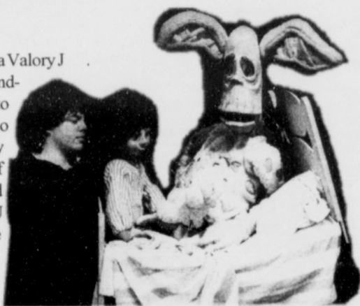
The Tears of Joy Theater will be showing a puppet rendition of the Mercer Mayer story called "There's a Nightmare in My Closet" from Dec. 15 - Dec. 31.