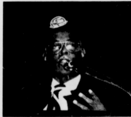
Edward P. Drummond Jr.

William "Bill" Ellis, Alexander Jefferson, Harry Steward, Edward P. Drummond Jr., William H. Holloman III