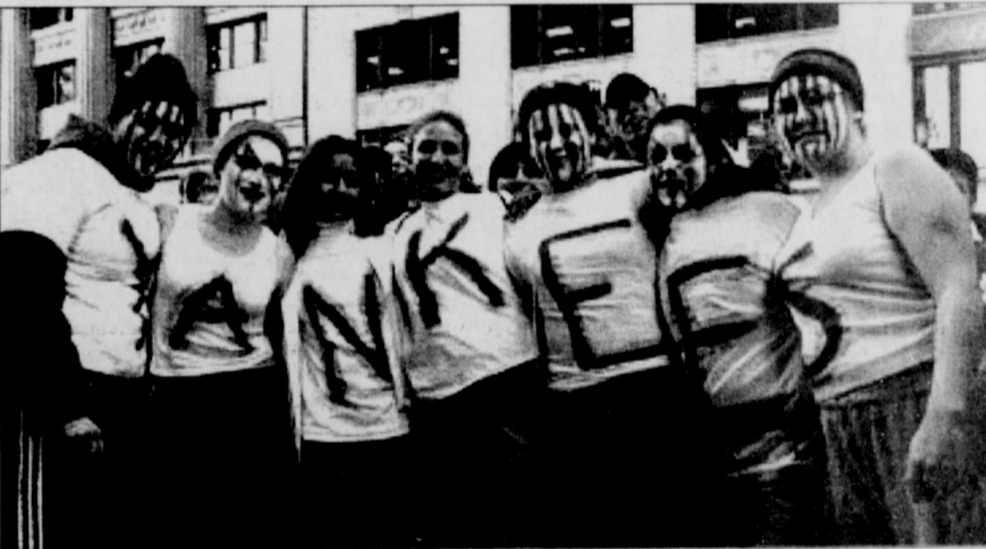
Fans leave no doubt about their loyalties as they gather to cheer on the New York Yankees during a Ticker Tape Parade.

NEW YORK (AP) — Yankees fans aren't getting tired of these ticker-tape parades.