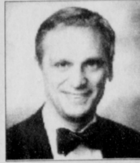
Earl Blumenauer, Congress 3rd District