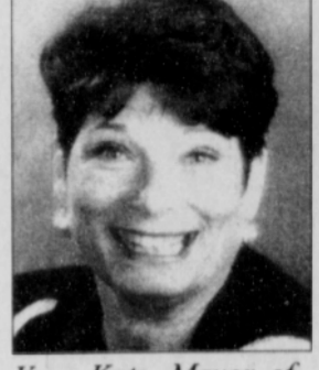
Vera Katz, Mayor of Portland