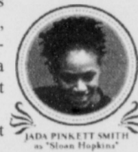
JADA PINKETT SMITH as "Sloan Hopkins"

Synopsis: Pierre Delacroix is a young, Harvard-educated man, who is the sole person of color, writing for an upstart network with floundering ratings. Despite several attempts, Delacroix has yet to see any of his concepts go into production. Now his boss, the ratings-hungry, culture-vulture Dunwitty, issues him a searing ultimatum: come up with a hot, trend-setting, headline-making, urban hit or get fired.