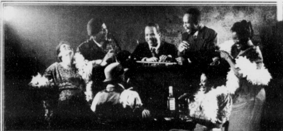
Based on the legendary life of Fats Waller of Harlem during the glamorous 1930's, Ain't Misbehavin' is a timeless Broadway musical which will be playing at the Artists Repertory Theatre from Nov. 5 - Dec. 17.

Tickets for Friday and Saturday are $26 regular/senior; $15 students. For ticket information, call 503/241-1ART.