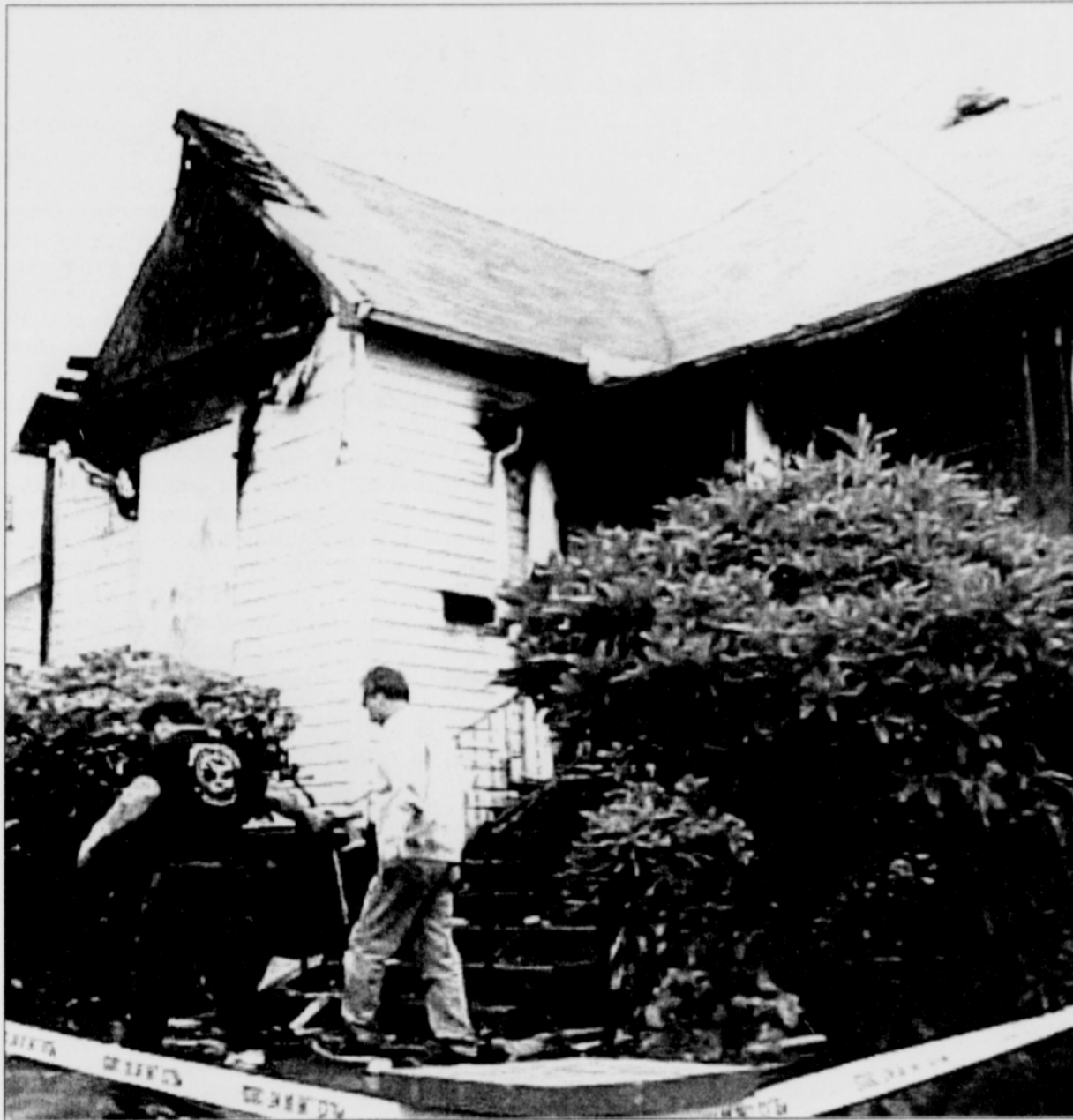
Investigators look for clues to a fire that swept through a northeast Portland home.