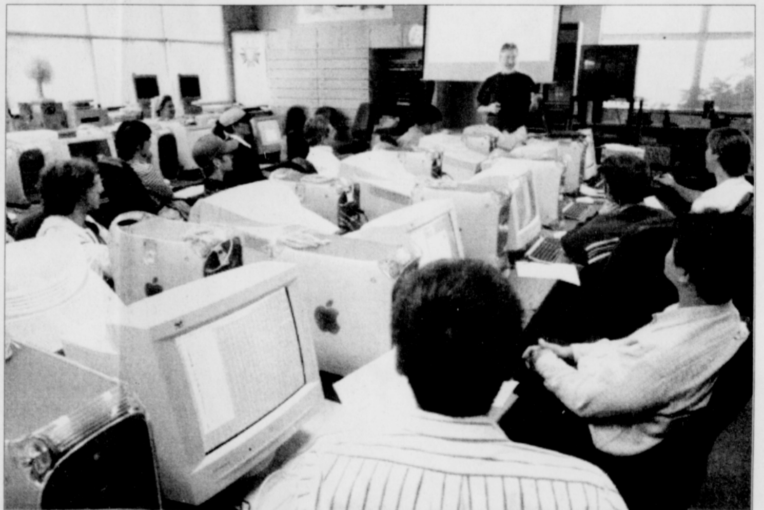
A crowded classroom at Portland Community College demonstrates how soaring enrollments have put a strain on buildings that need upgrading and repairs.

"The bond is critical," said Moriarty. "The college will have to pull money from its already taxed instructional budget without added funds." In May, PCC proposed the same measure, and it was narrowly defeated. The measure won approval by more than 57 percent, but the voter turnout was 49.6 percent, a fraction of a percent short needed for approval. In Oregon, in all but general elec-