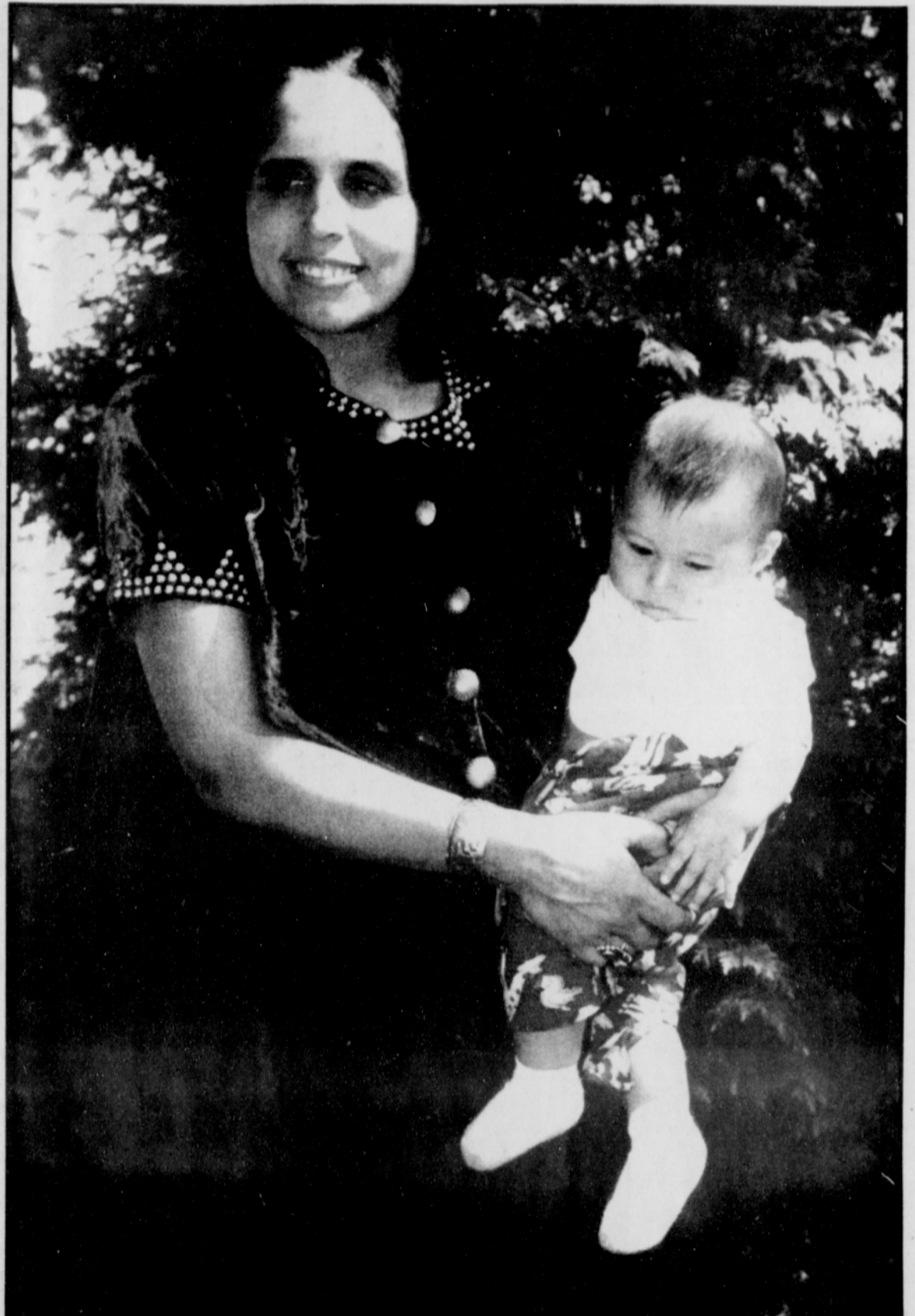
Winona LaDuke, a Native American Indian is the Vice Presidential running mate to Ralph Nader of his Green Party and a former Oregonian.

Winona LaDuke: I have two facets of business work in my life. One is that I directed a nonprofit organization that has a marketing arm that markets wild-life, maple syrup, hominy corn, preserves and local craft items from many reservations. We've been very careful in our production choices. We've had a lot of options in terms of producing in ways that would be faster, more mechanized and using different chemicals. We made a series of choices because we wanted to not only preserve an eco-system and a culture, but also we want to be in charge of choosing the technology and not have the technology choose us. We've made very careful technologically and environmentally sound choices.