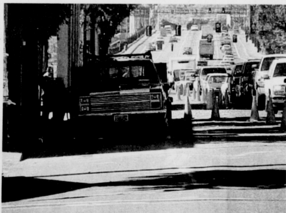
Workers are adding Portland's historic street lights to east burnside.