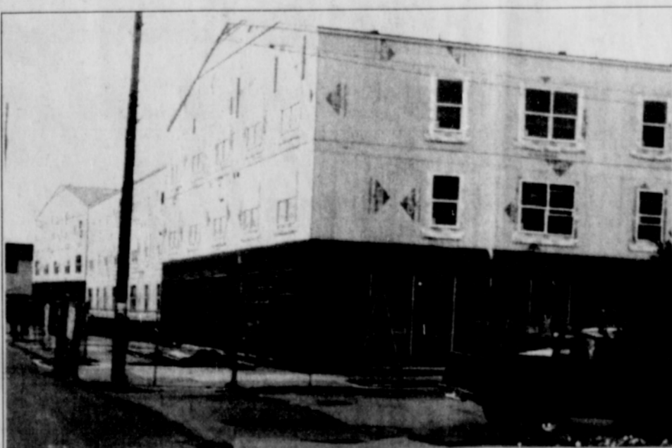
A combined housing and retail complex rises from the corner of Vancouver and Killingsworth, a block once known as Delicious D's and formerly Bun 'N Burgers restaurant.