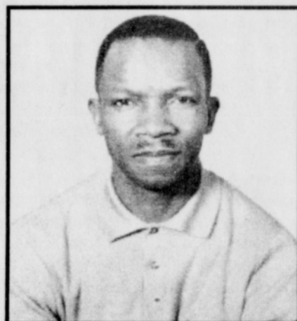
Founder of Scarborough Oil NKA: Dad's Oil