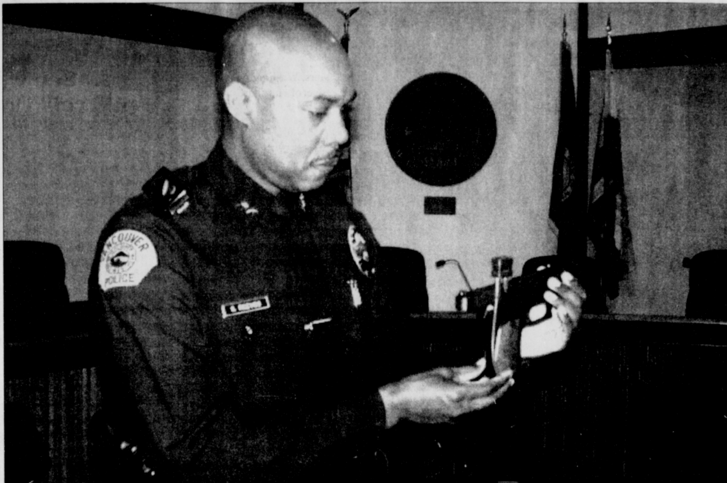
Stan Reeves, Interim Vancouver Police Chief discusses the free gun locks during a press conference

On August 18, 2000 Interim Vancouver Police Chief Stan Reeves held a News Conference to announce that the Vancouver Police Services will begin distributing 3500 free gun locks.