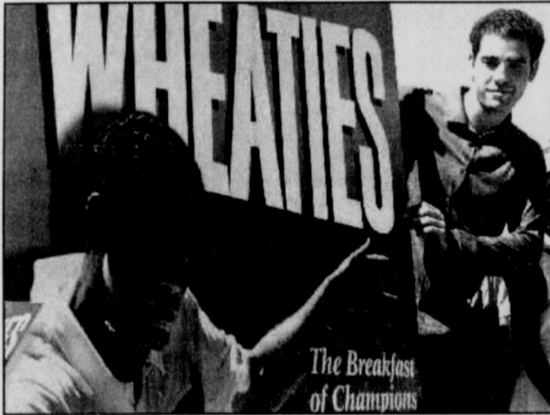
Wimbledon champion Pete Sampras poses at an event promoting the appearance of his likeness on a special edition package of Wheaties cereal, July 11 in New York. In winning Wimbledon on July 9, Sampras earned a record-setting 13th Grand Slam title

playing the game at 30 like Graf. She has denied reports that she thought of retiring earlier this year but she wants education, a career and a full life. "You know I wouldn't be any happier in my life in general if I had won or lost," she said after the singles final. "Winning losing, money, riches or fame don't make you happy." "For my tennis career, this is great. But as far as being Venus, it doesn't really make a huge difference." Injury could also play its part in their futures. Venus was out for five months with tendinitis in both wrists while Serena has also missed several tournaments this year with injuries. But, when fully fit, they appear to have too much power for world No. 1 Martina Hingis, whose best days may be behind her at just 19, although a fully fit Davenport has the tactical know-how to test the sisters who won the doubles title Monday.