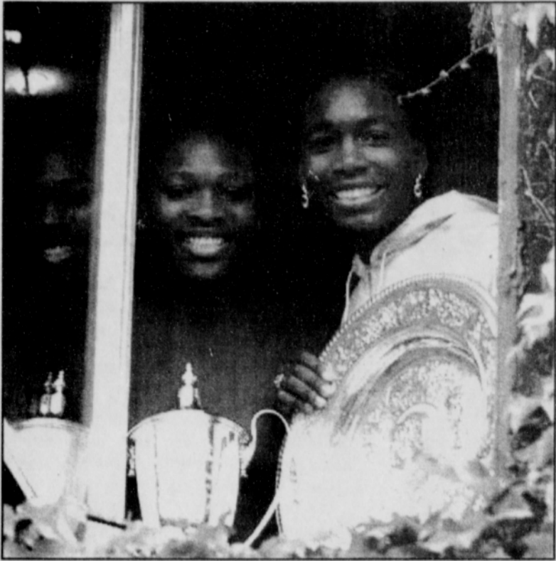
Venus (R) and Serena Williams of the USA lean out of the ivy covered window of Centre Court at Wimbledon after winning the women's doubles title July 10. Venus Williams also won the women's singles title three days ago.