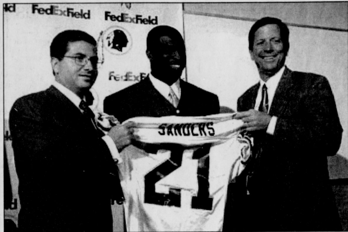
Deion Sanders, center, with Redskins owner Dan Snyder, left, and head coach Norv Turner, right, holds his new Redskins jersey at a press conference at Redskins Park Monday, June 5, 2000 in Ashburn, Va., just outside of Washington. Sanders signed Monday with the Washington Redskins to a seven-year, $55 million contract.