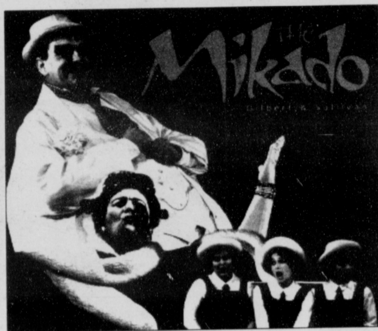
CONTRIBUTED STORY FOR THE PORTLAND OBSERVER

Before Monty Python, before the Marx Brothers, there was Gilbert and Sullivan. With witty lyrics, whimsical plots and captivating music, these comic masterminds have kept audiences in stitches for more than 100 years. A topsy-turvy tale of star-crossed sweethearts and petty tyrants, The Mikado is a deliciously satiric look at bureaucracy, hypocrisy, and the trials and tribulations of true love. Giddy schoolgirl Yum-Yum is pledged to marry her guardian, a seedy playboy named Ko-Ko, who has just been appointed to the exalted rank of Lord High Executioner. A "wandering minstrel" who calls himself Nanki-Poo arrives in town in search of Yum-Yum, with whom he has fallen madly in love. When the Mikado,