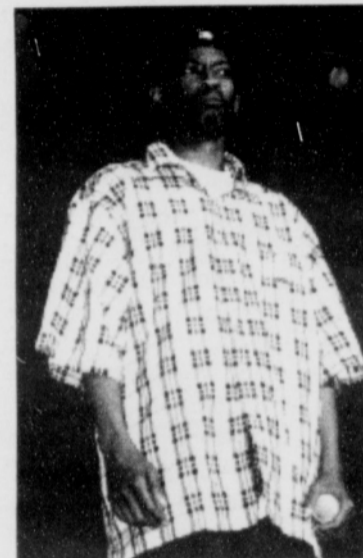
Hip-hop artist Kurupt at a concert held in Portland Last week

What's next on the shelf for Kurupt? Glad you asked that. I'll be out on Cali with Dr. Dre for the shoot of his next video "The Next Episode".