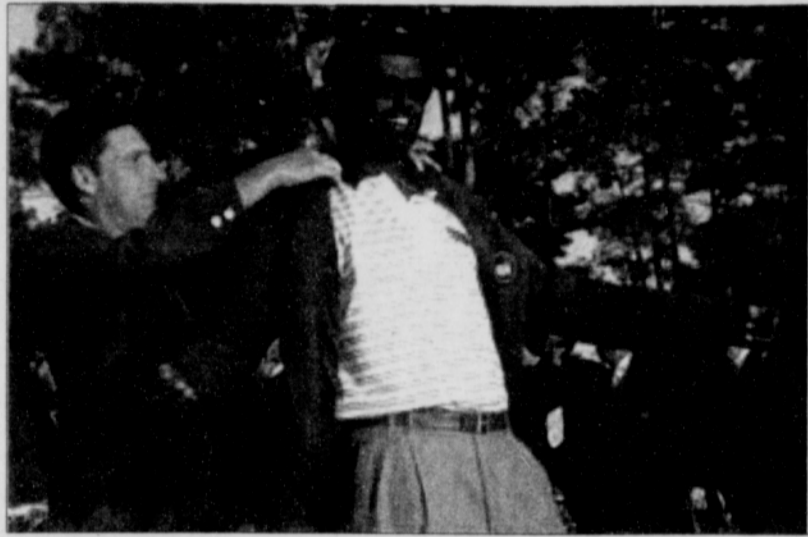
Jose Maria Olazabal, from Spain, puts the green jacket on Vijay Singh, from Fiji, after Singh won the 2000 Masters at the Augusta National Golf Club in Augusta, Ga., Sunday, April 9, 2000.

How else to explain what happened Saturday at the par-3 12th? David Duval, tied with Singh at 5-under, hit an 8-iron that was right on