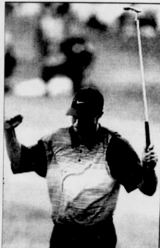
Tiger Woods played the final 34 holes at Bay Hill without a bogey