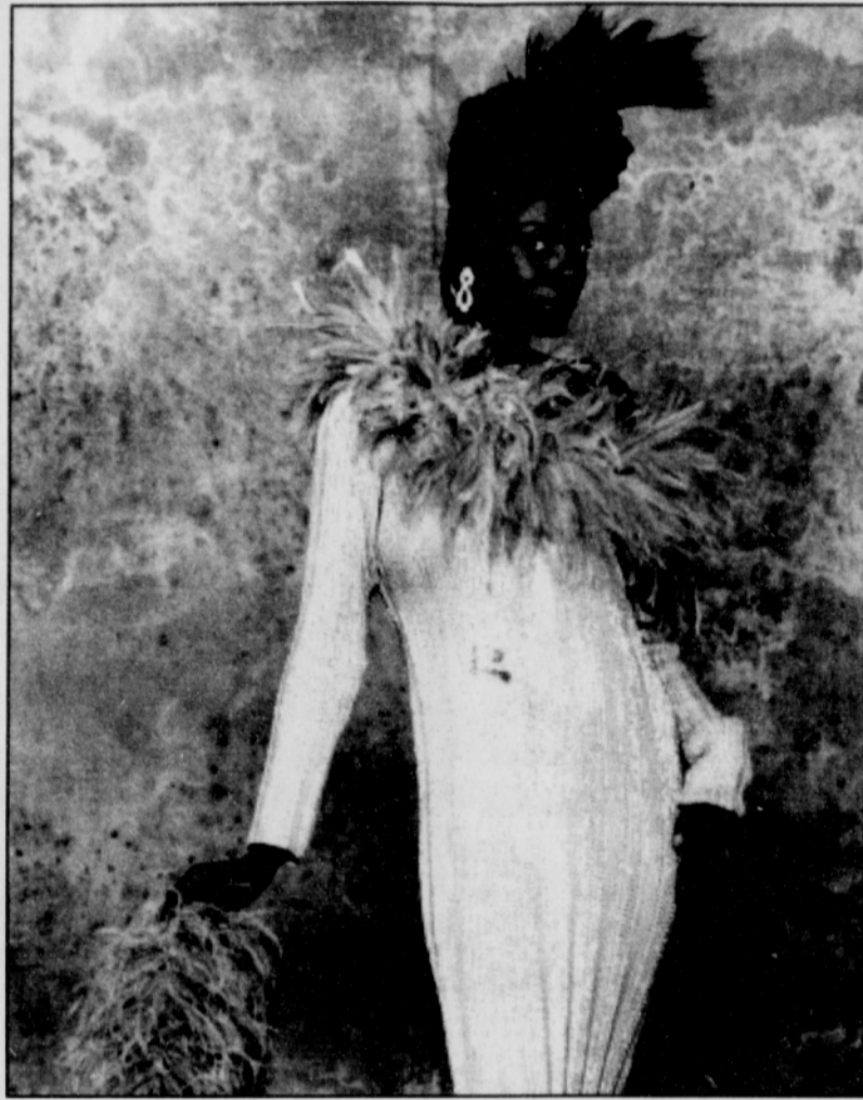
Japan's Hanae Mori designs this all-over bugle beaded silk-rib knit tube dress with asymmetrical feathered neckline.