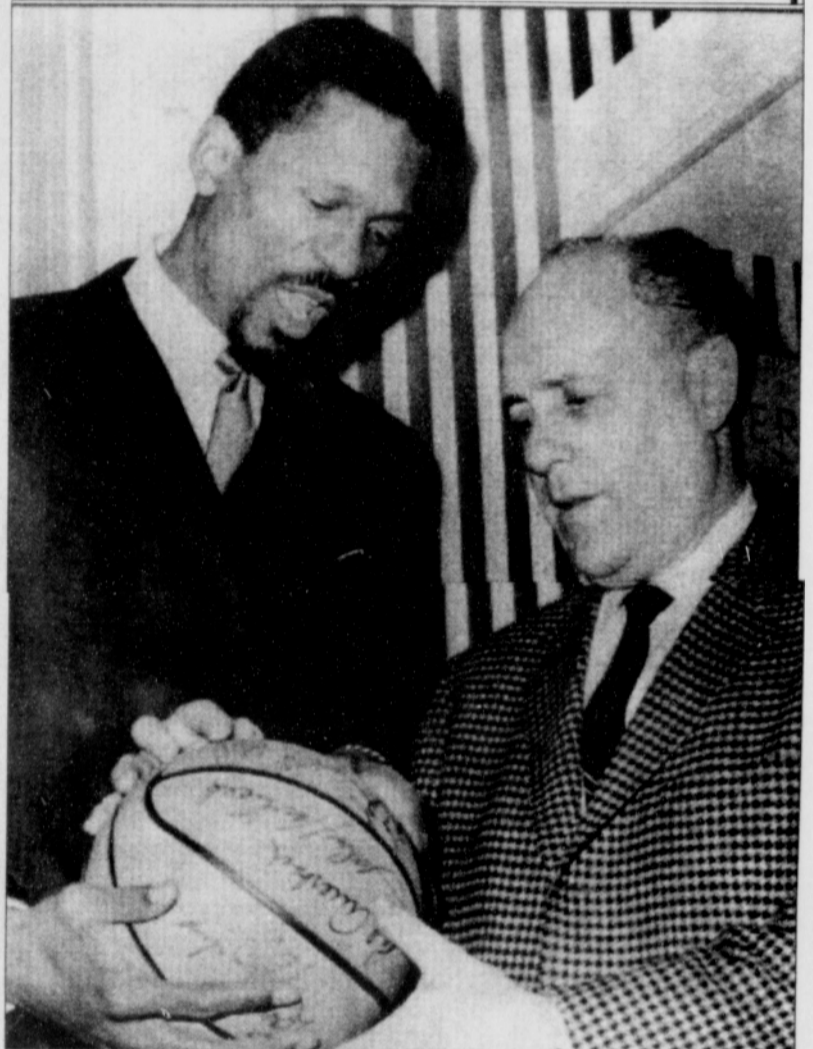
Bill Russell succeeds Arnold "Red" Auerbach as coach of the Boston Celtics and becomes the first African American head coach of a major-league sport in the United States, 1966.

Consistently voted the most valuable player in NBA history, William Fenton Russell (born 1934) led his University of San Francisco basketball team to two NCAA titles, while suffering only one loss in his college career. He was chosen Most Outstanding Player of the 1955 NCAA Tournament and was a member of the 1956 United States Olympic basketball team. So dominant was Russell as a rebounder that the NCAA adopted what was known as the Russell Rule: at the end of 1955, the NCAA doubled the width of the field goal lane, from six to twelve feet. Still, Russell dominated NCAA rebounding. Bill Russell has more championship titles than any other American athlete in major sports. As a Celtic, Russell led the team to eleven NBA titles, beginning in 1957. Russell was named Most Valuable Player of the National Basketball Association in 1958, but was not named by sportswriters to the all-NBA team. He also won the MVP award in 1961, 1963, and 1965 and the NBA All-Star Game MVP award in 1963. For the 1966-67 season, Russell was named player-coach of the Celtics and later coached the Seattle Supersonics and the Sacramento Kings. He was inducted into the Basketball Hall of Fame in 1974 and chosen to the NBA 25th Anniversary All-Time Team in 1970 and the 35th Anniversary Team in 1980.