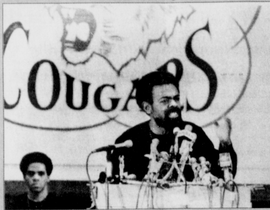
This week's observation of Black History Month covers the years of 1950-2000. Amiri Baraka was known during the 1960s for his racially focused and high voltage writings - influenced early on by New York Bohemians and later by his encounter with art-revolutionaries in Cuba. This man was the architect of a national movement. Can you name it? For the answer, look in Focus under the header, B.