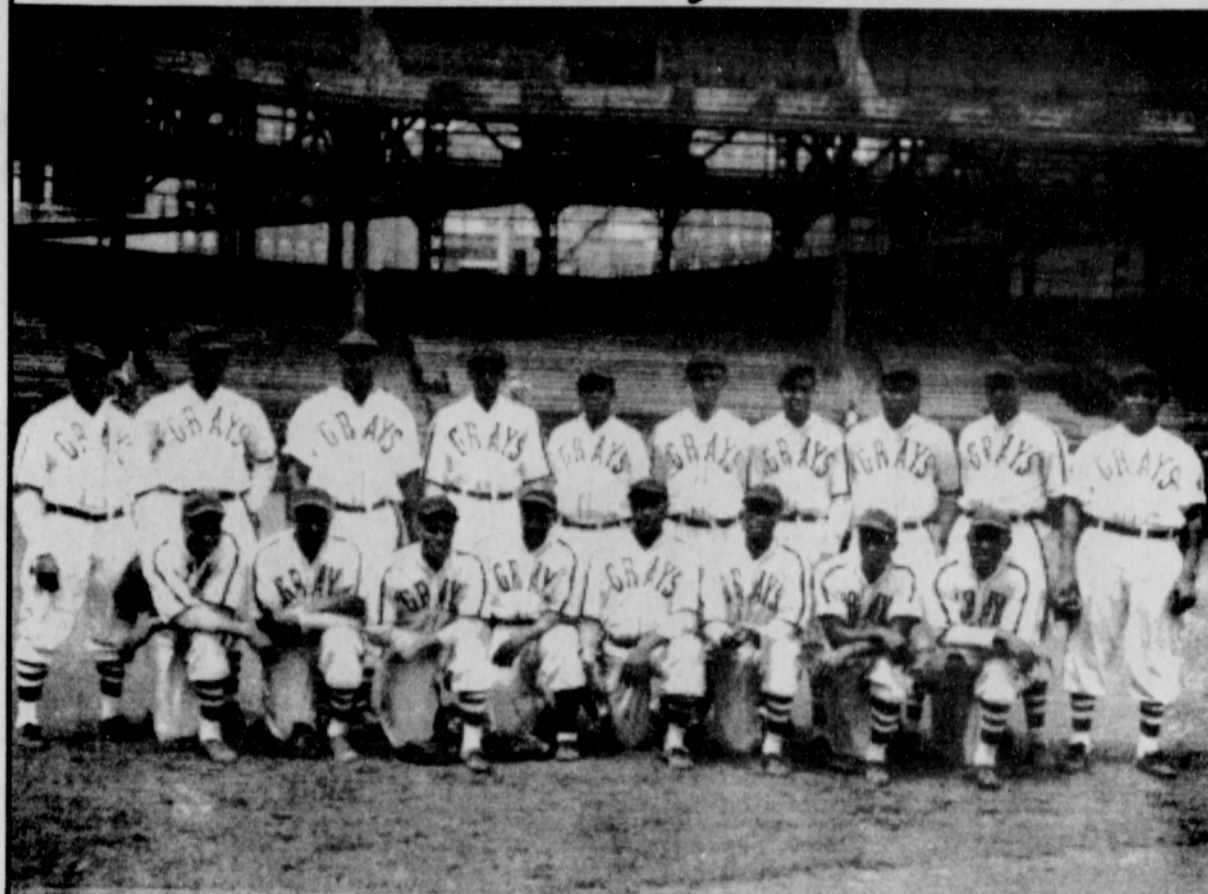
These were the Black Boys of Summer. They were not boys at play but men at work. Most would have been laborers, waiters, or janitors, but for a good arm, flash speed, fetchin' catchin that allowed them to make a living at something more pleasurable and better paying. This week's observation of Black History Month cover the years of 1900-1950. Can you name the "Father of Negro Baseball" who organized many teams and the East-West Games that drew huge crowds of 40,000 - 50,000 - many more than any current All-Star Game. For the answer, see Focus.