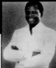
Sidney Poitier February 2 at 8pm