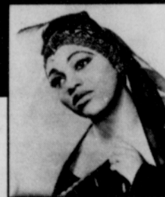
Marian Anderson February 16 at 9:30pm