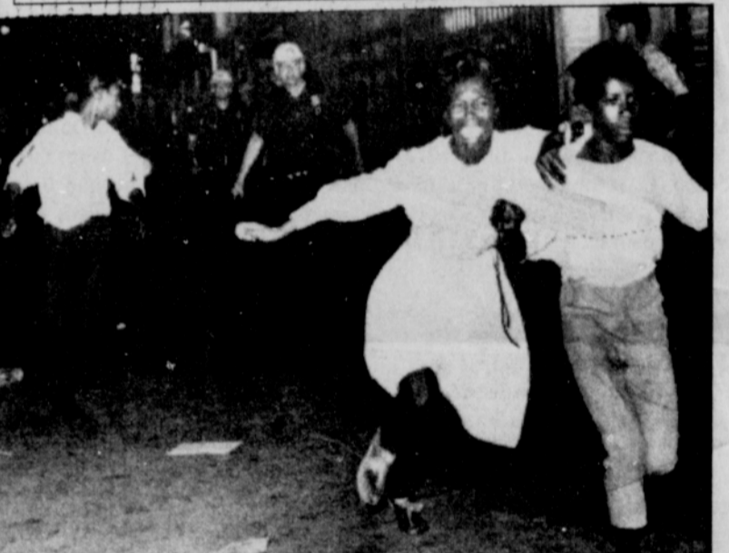
Violence erupted during a protest in Memphis, a week before Martin Luther King Jr. was assassinated there.