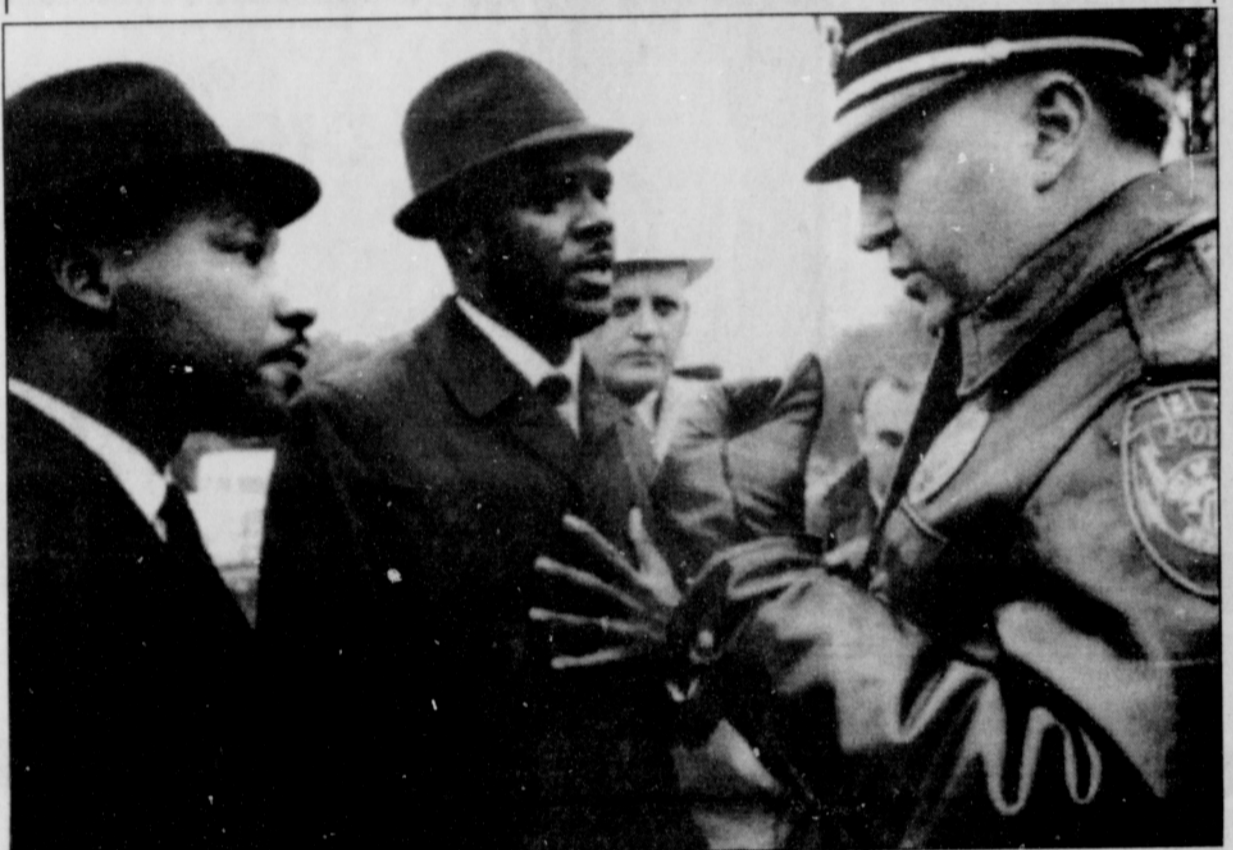
Police Chief Laurie Pritchett of Albany, Georgia, placing Martin Luther King, Jr., and Dr. W.G. Anderson under arrest.