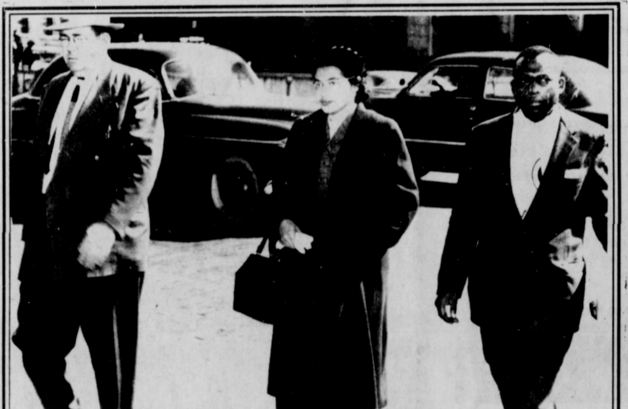
Rosa Parks, flanked by her attorney and a deputy, on her way to the jail. Parks refused to move from her up-front seat on a bus in Montgomery, Ala. in 1955.