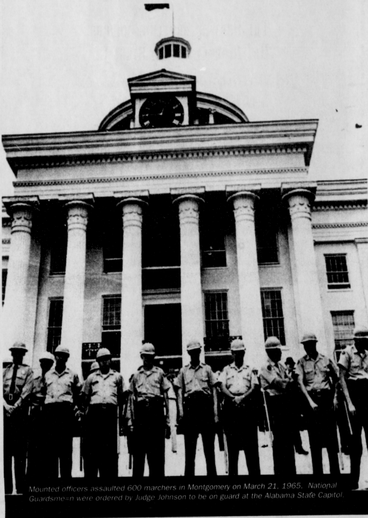
Mounted officers assaulted 600 marchers in Montgomery on March 21, 1965. National Guardsmen were ordered by Judge Johnson to be on guard at the Alabama State Capitol.