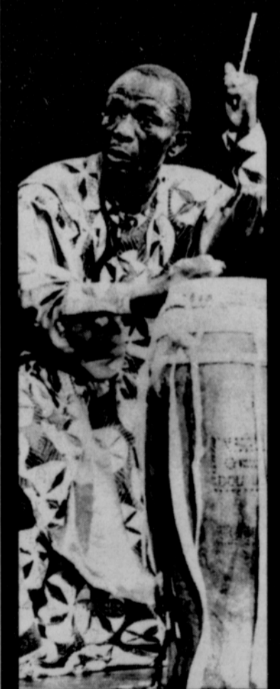
Doudou N'Diaye Rose Supported by KEX

ARLENE SCHNITZER CONCERT HALL SW Main & Broadway • Portland Center for the Performing Arts