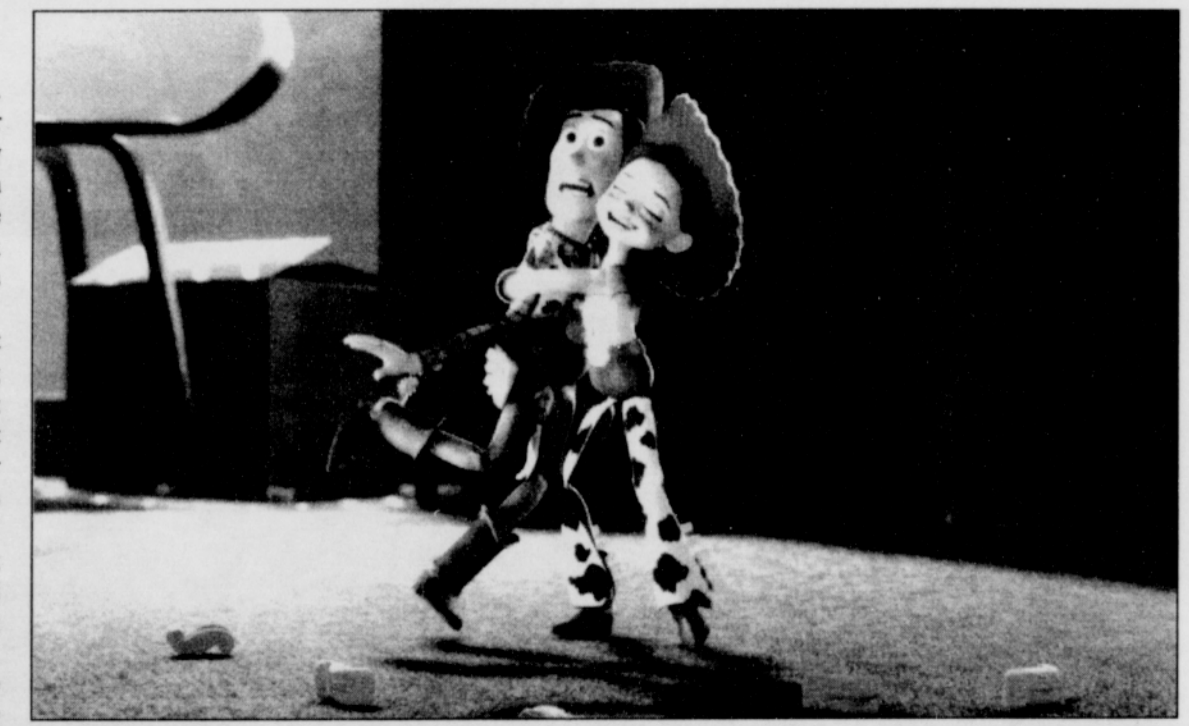
Woody gets a rousing welcome from his TV co-star, Jessie the cowgirl in his new movie 'Toy Story 2' from Disney and Pixar studios.

"Kids know all the characters. The film was well-reviewed, so parents