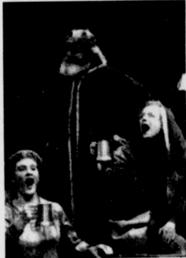
The 1999 Christmas Revels will transport the audience to medieval France for a holiday feast of music, theatre and dance.