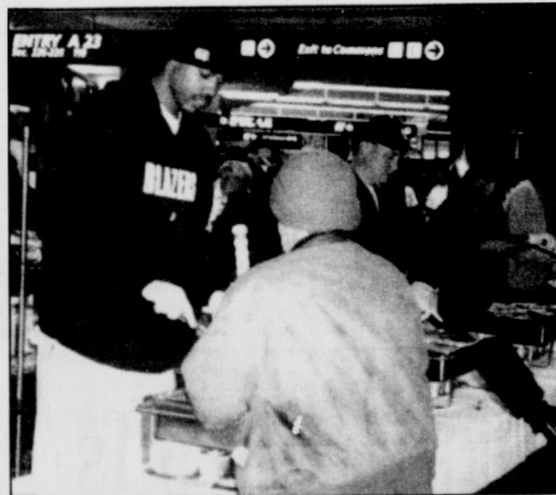
Rasheed Wallace serves out dressing to the needy during the 4th annual Harvest Dinner.