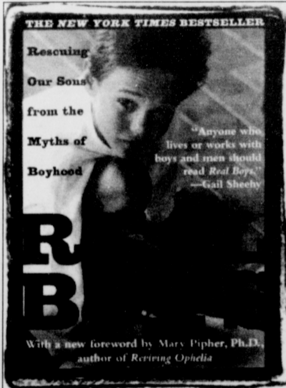
WILLIAM POLLACK, Ph.D.

hood and masculinity that encourage parents to treat boys as little men, raising them through a toughening process that drives their true emotions underground. Only when we understand what boys are really experiencing, says Pollack, can parents and teachers help them develop more self-confidence and the emotional savvy they need to deal with issues such as depression and violence, drugs and alcohol, sexuality and love.