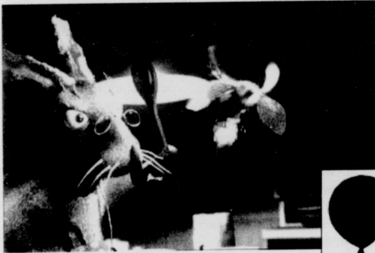
(above) WINNER OF THE 1998 ACADEMY AWARD FOR BEST ANIMATED SHORT FILM. BAKING ALONE IN HER KITCHEN, TATTERED OLD BUNNY RECEIVES A TROUBLESOME LATE-NIGHT VISITOR FROM THE DEEPEST WOODS. WHAT IS IT ABOUT THIS NOCTURNAL PEST THAT STIRS HER DEEPEST FEARS AND MEMORIES?

Animation fans will delight as the 1999 Spike & Mike's Classic Festival of Animation opens in Portland. Bring the kids and join us at Cinema 21 as we showcase this year's collection of world class animated short films from France, the Netherlands, England, Germany, Canada and the United States. The 1999 Festival's limited engagement opens Friday, October 22 and will screen TWO WEEKS ONLY through Thursday, November 4.