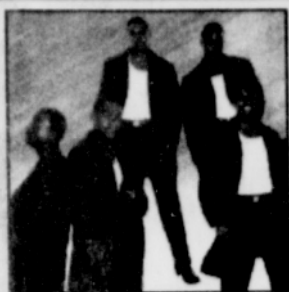
See this weeks Focus

Flavor of the Month Check out the new flavor in Focus