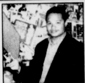
See Minority Business Week

Flavor of the Month Check out the new flavor in Focus