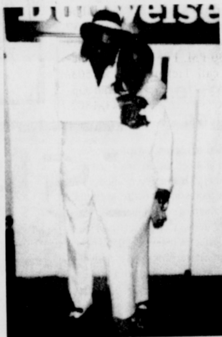
- John Wayne