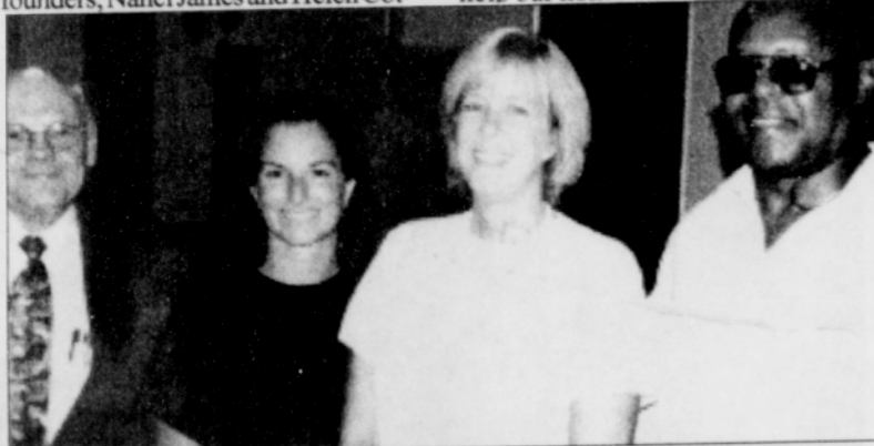
It's Back...Boxing in Oregon.