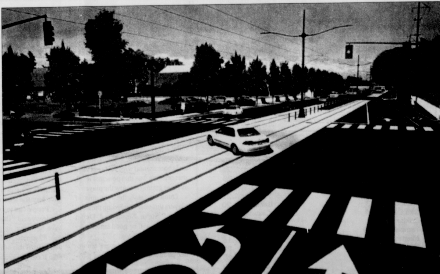
A visual simulation of N Interstate at N Alnsworth facing north.