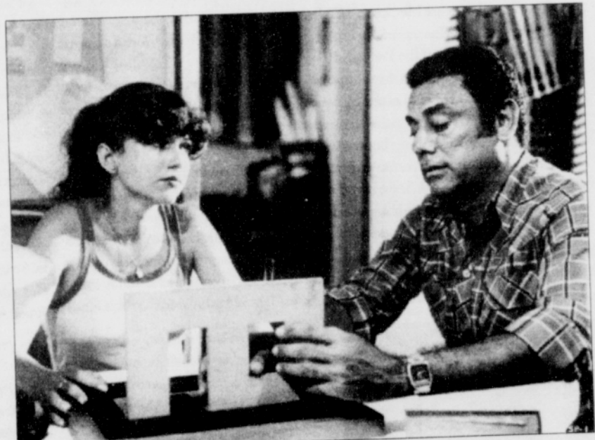
"House For Swap" (Se Permuta).

win them a dream house. And of course no sooner is the plan in place than the lovers start swapping partners." (103 mins.)