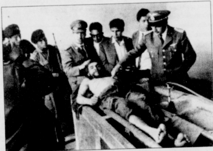
"The Day You'll Love Me (El Dia Que Me Quieras)" will be playing on Friday, October 8 at 7:30 PM and Thursday, October 14 at 7 PM.