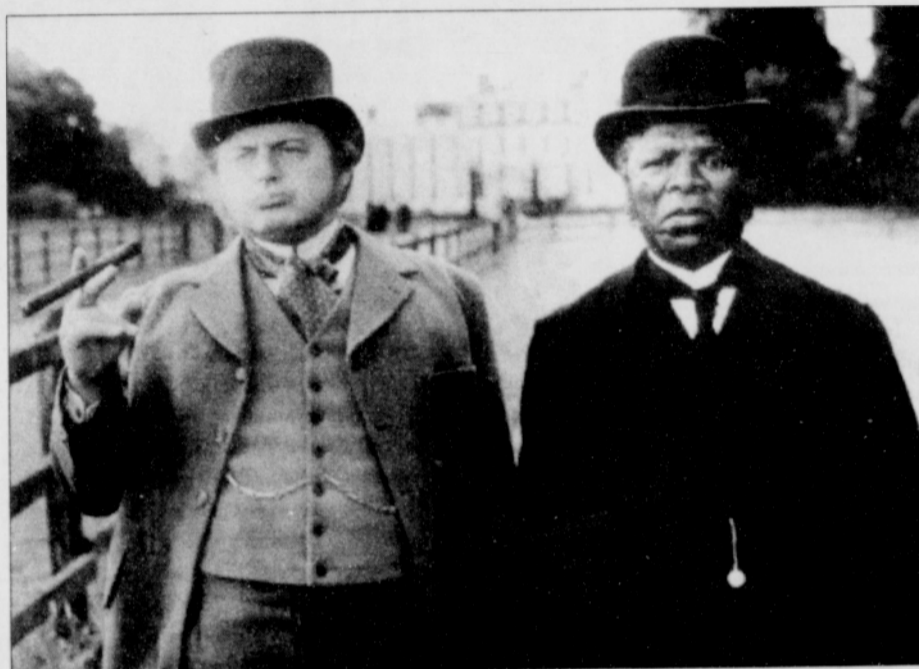
Robert Pugh (left) and John Kani (right) in THE TICHBORNE CLAIMANT.