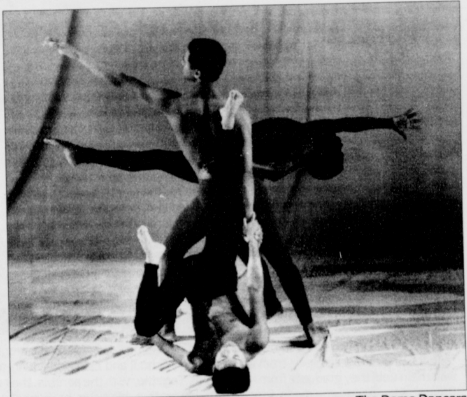
The Jefferson Dance Program is composed of three groups: The Demo Dancers (Junior-level dancers of Jazz, Modern, Tap and Ballet), Modern Dance Lab (members perform contemporary and popular works), and The Jefferson Dancers (the most advanced dancers).

The prospects for students at Jefferson in the 1999-2000 school year are bright. An experienced and committed staff is in place. Time tested programs are still in operation and new programs to meet the needs of a range of students have been instituted. Jeff is open for business. Students who go to Jefferson and take advantage of the opportunities available to them will find the people and programs in place to start them, well prepared, on the road to their after high school futures.